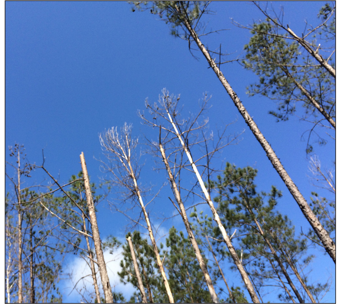
Symptomatic loblolly site having weakened and dead trees.

Sites where loblolly pines are symptomatic for SPD tend to have sparse crowns, heavy cone crops, and short/yellow needles, with mortality more random than that observed by primary insect and disease species (Coyle et al. 2015). SPD has been mostly identified with stands along the fall line between the Piedmont and Coastal Plain in Alabama and Georgia. Within this area, the forest industry has suggested that symptomatic stands have differing weight scaling factors than asymptomatic stands, and thus it appears that green moisture content is altered. It remains to be determined if trees from symptomatic stands have different wood density allocations that would negatively affect the overall quality of wood.