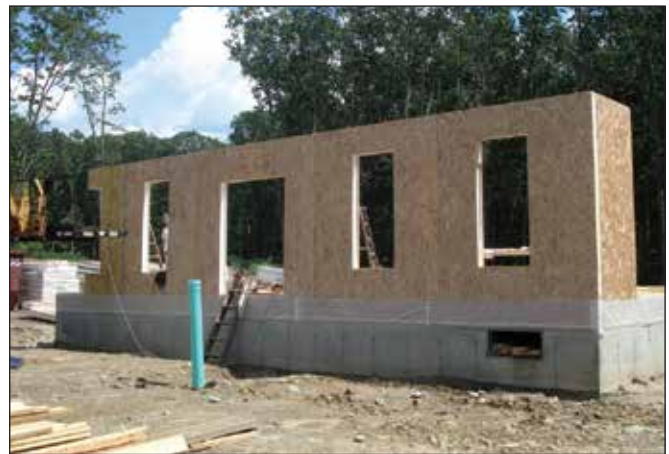
Figure 1—SIP panels used in wall construction.

In a 2010 pilot study conducted by APA–The Engineered Wood Association and the Structural Insulated Panel Association, SIP walls were tested in accordance with both monotonic and cyclic loading protocols, with the SIP walls constructed to bear on wood cap and sill plates. SIP walls so constructed were found to have a significantly higher over-strength factor and lower ductility than conventional walls. The research results led to the development of a lateral load test method specified in ANSI/APA PRS 610.1 for the qualification of SIP walls. However, the APA Standards Committee on