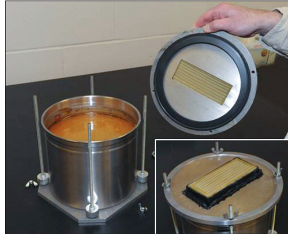
Figure 2. Example laboratory testing facility and set up for CLT material characterization.

This project will generate three benchmark data sets for multistory CLT building moisture performance in different climate zones. Data will include moisture contents at key wood components and high moisture risk locations throughout the buildings. A relatively simple, but fully validated, numerical model for analyzing similar building moisture performance will be recommended. These results will be useful for structural engineers and architects to accurately consider moisture in their design of mass timber buildings. Outcomes from this project will fill the knowledge gap of realistic CLT building moisture transfer characteristics, and confidence in using CLT in large building projects will be boosted. Building owners and the public will look more favorably on CLT as a valid option for urban construction at large scale, thus creating new markets for biomass products and new jobs related to wood and forest industries.