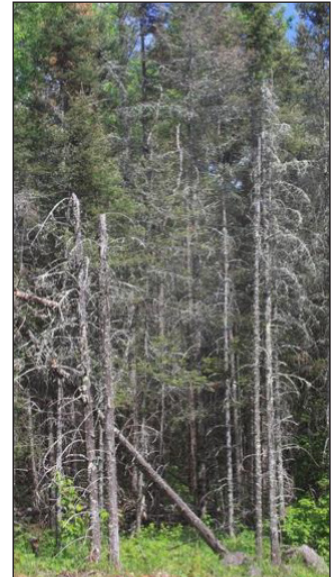
Spruce budworm mortality, Chequamegon–Nicolet National Forest, Summer 2014 (Steven Katovich, USDA Forest Service, Bugwood.org).

If forest managers were able to accurately measure the quality of wood in individual standing trees during salvage operations, they would be able to sort the logs for sale by quality. Logs from trees with higher wood quality could be separated and sold at higher values. Logs from trees with lower wood quality could be sold for pulp and paper or bioenergy applications, and trees that do not reach minimum standards for utilization would be left in the forest as dead standing snags or coarse woody debris. By optimizing returned value