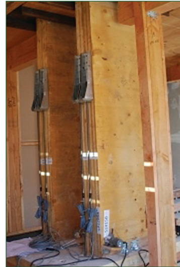
Figure 4. CLT repair option.