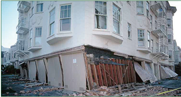
Figure 2. Soft story collapse of structure during the 1984 Northridge earthquake.