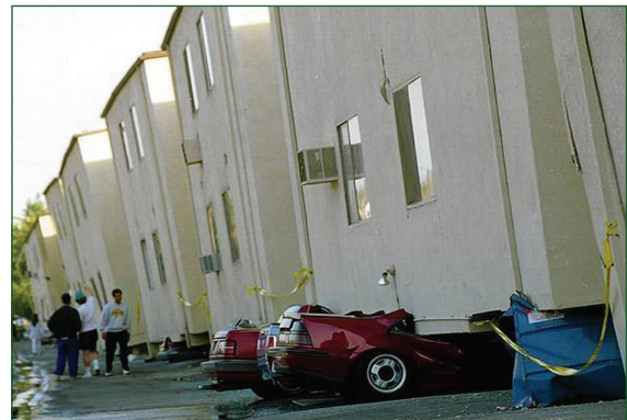
Figure 1. Soft story collapse of multifamily wood-frame structure during 1989 Loma Prieta earthquake.

The NEES–Soft Project, focused on seismic risk reduction for soft story wood-frame buildings project and funded by the National Science Foundation, is a