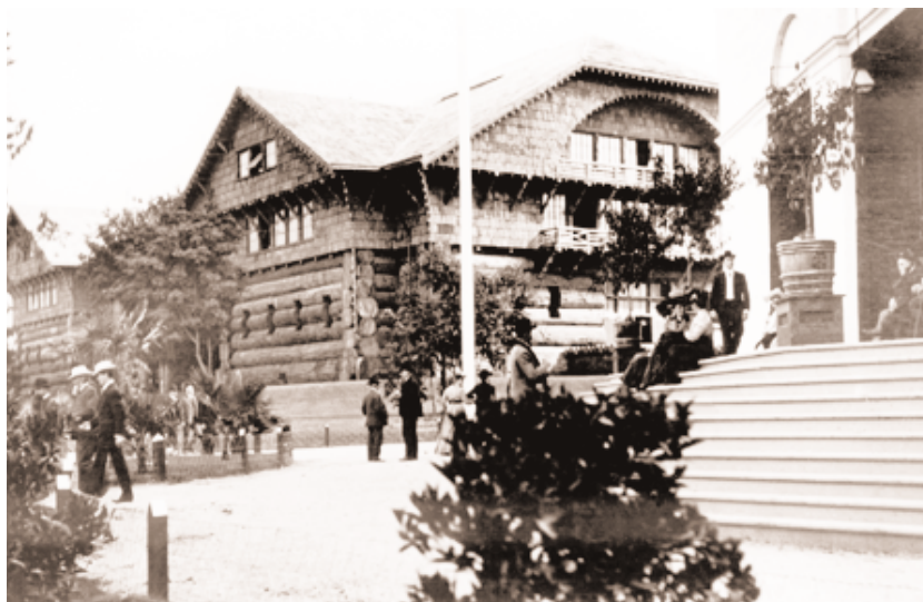
The Forestry Building in Portland, Ore., as it appeared about the time of the Lewis & Clark Exposition when the first plywood panels were displayed. The display was kept intact until the building burned in 1964.

Simpson Timber Company purchased all the M and M holdings in the spring of 1956. Kevin Carty was manager of Plylock for Simpson until the plant was no longer suitable to compete efficiently with the more modern plants. It discontinued production of plywood in September 1963, after nearly sixty years.