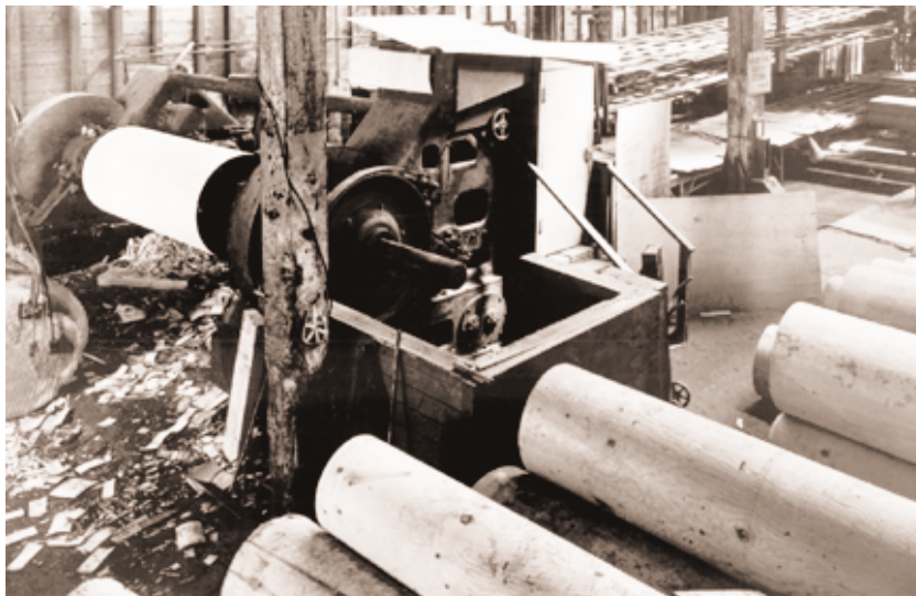
Green-end in the rebuilt plant was highly efficient for those times.