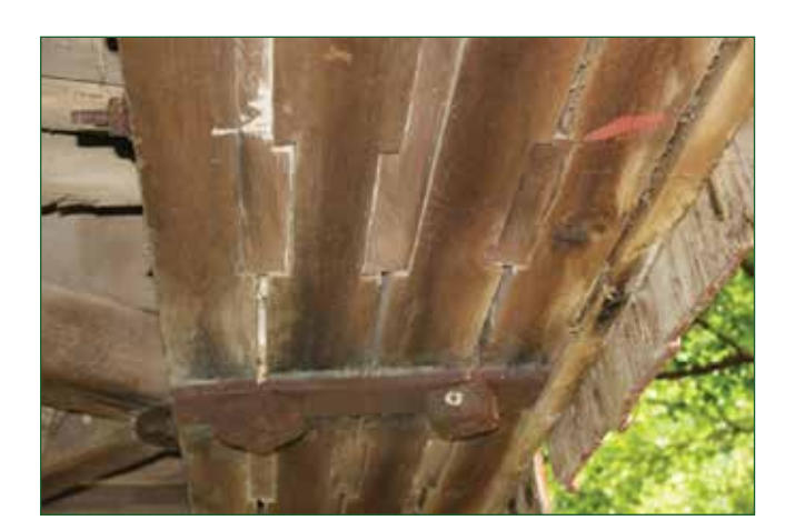
Figure 3—Bottom chord connection detail.

Figure 2— Phase I Queen Post Truss in Flint, Vermont.