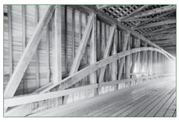
Figure 1—Burr Arch covered bridge.

The USDA Forest Products Laboratory in cooperation with Iowa State University has been improving the analytical modeling for covered bridges, specifically the Burr Arch and Queen Post Truss (Figure 2). The objective of this research is to develop techniques and provide recommendations for improving the analysis of historic covered timber bridges. Initial work indicated a critical need to identify material properties of dominant members to improve the correlation between measured loading test results and modeling. Typically, wood used in historic structures was local to the bridge and of a species not traditionally used in modern construction, for which engineering properties are readily available. This work focused on planer models and using modulus of elasticity values determined by nondestructive results of load rating tests. The work also noted that additional important parameters are connection behavior (Figure 3) and out-ofplane deformations.