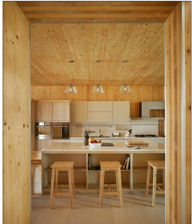
Figure 2. Interior view of a CLT building.

In the United States, most CLT boards are made of southern yellow pines and Douglas-fir, the two wood species that are not naturally durable (unlike cedar) and need to be treated by preservative formulations. Borate has been proven to effectively protect wood against decay fungi and termites. In addition, borate