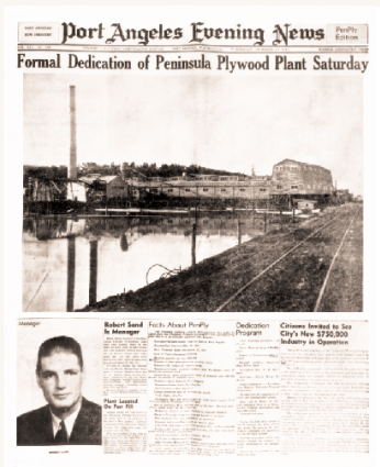
Page one of the December 10, 1941 PenPly edition of the Port Angeles Evening News.