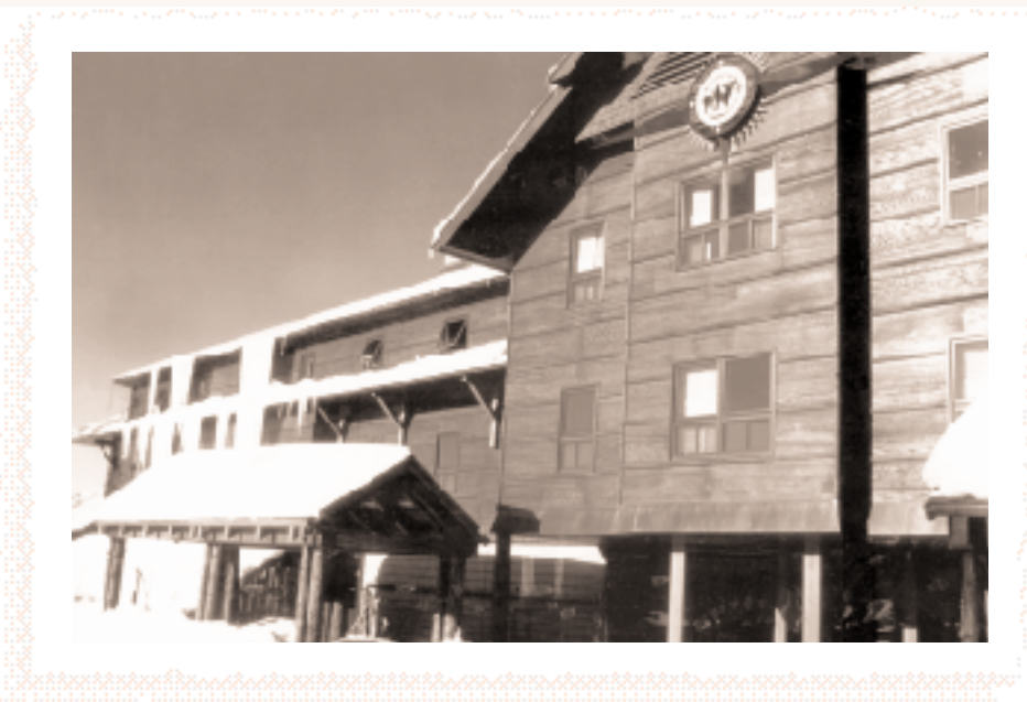
Clear Cedarply panels from K Ply were the exterior siding choice for the Old Faithful Snow Lodge in Yellowstone National Park.