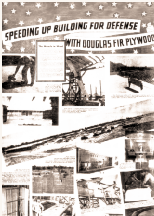
A page from one of the nearly 30 features provided by the Douglas Fir Plywood Association in the December 10, 1941 PenPly edition of the Port Angeles Evening News.

The Milwaukee Road reminded the public that “happy holidays start on the electrified Olympian connecting Tacoma, Seattle, Spokane, Butte, Minneapolis, St. Paul and Chicago.” The train company promised a “smooth, silent ride over the mountains.”